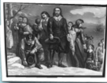
The Mayflower had carried 102 pilgrims. Some of them are exhausted.